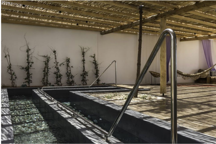
Kneipp pools at Evexia Spa