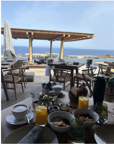
Breakfast at Pacman Bar - Restaurant