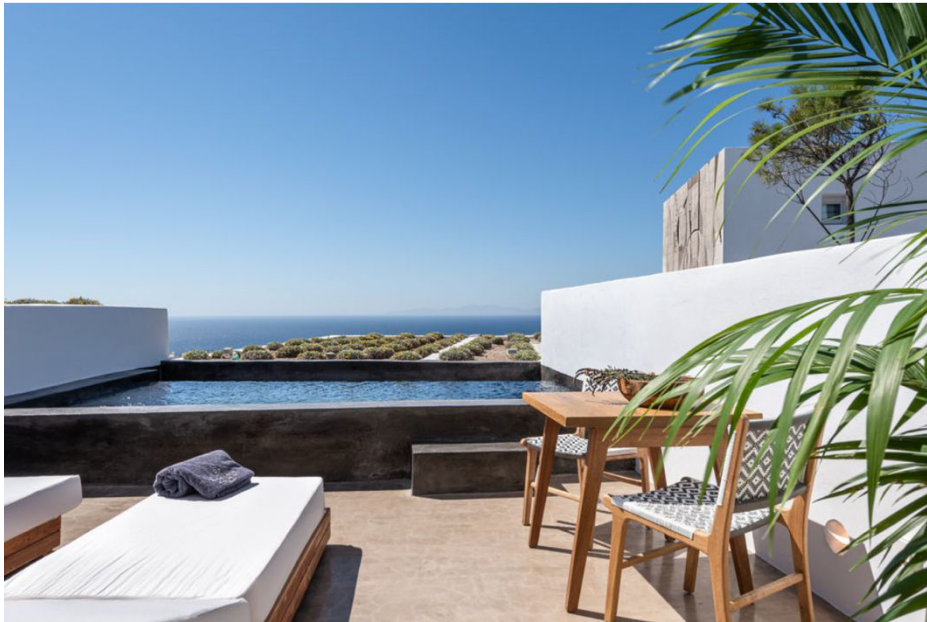
Sunset suite terrace

The contemporary vibe screams low-key luxury. Our room is decorated in a calming neutral palette, with rattan chairs, wooden wardrobes and a king-sized mattress placed directly on the elevated wooden floor. The whole aesthetic is incredibly calming. And gets our seal of approval as an ideal honeymoon lock-in.