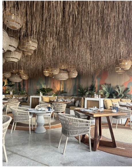
Dinner at Beefbar