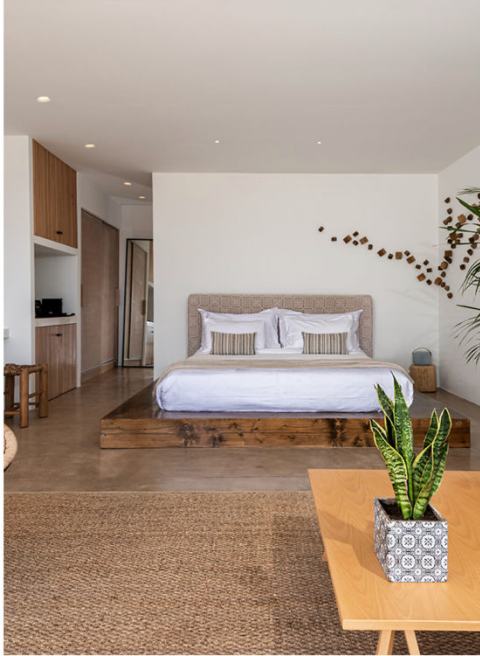
Sunset Suite.