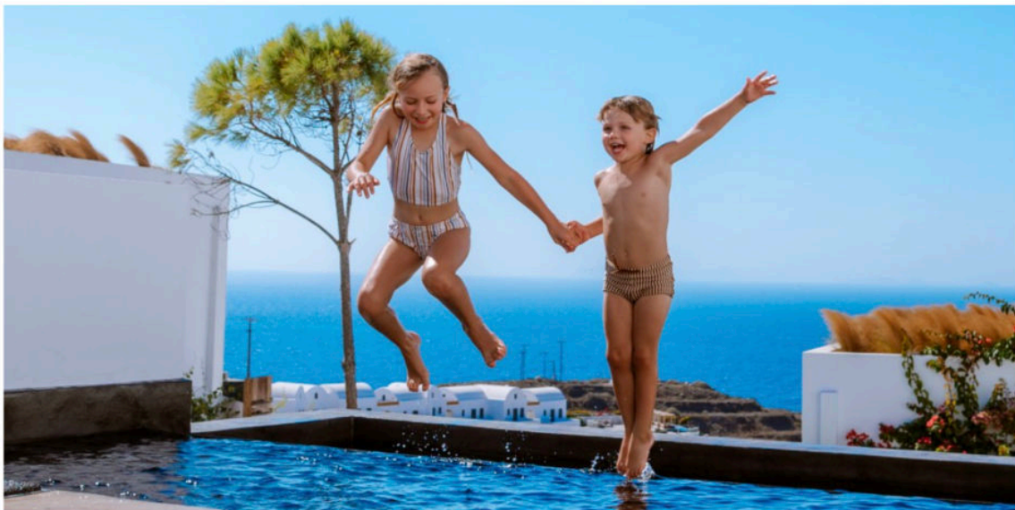
Andronis Arcadia, Santorini

Designed to inspire creativity, imagination, and innovation in children aged four to 14 years old, the new kids' club offers holistic learning experiences connected to the cultural heritage of Santorini and interpreted through carefully curated group activities.