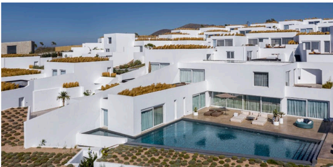
Eden Villa, Andronis Arcadia, Santorini

Have you noticed that resorts are paying a lot more attention to kids clubs these days? We have, and our eagle eyes have alighted on seven of the most extraordinary examples for kids aged from 0 to 12 years. Prepare to feel a tiny bit jealous of your children very soon!