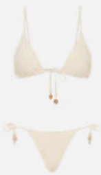
SEAFOLLY SEA DIVE SLIDE TRI - WHITE