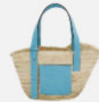
LOEWE SMALL BASKET BAG IN PALM LEAF AND CALFSKIN