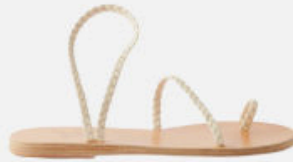
ANCIENT GREEK SANDALS - ELEFThERIA BRAIDED-LEATHER FLAT SANDALS