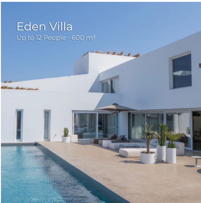
Eden Villa Up to 12 People - 600 m 2

Nestled in a secluded, peaceful area, embracing the sublime views of the famous Santorini sunset, the three-storey Eden Villa welcomes its guests to a holiday experience where time seems to stand still.