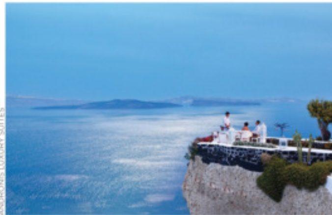
LYCABETTUS RESTAURANT AT ANDRONIS LUXURY SUITES